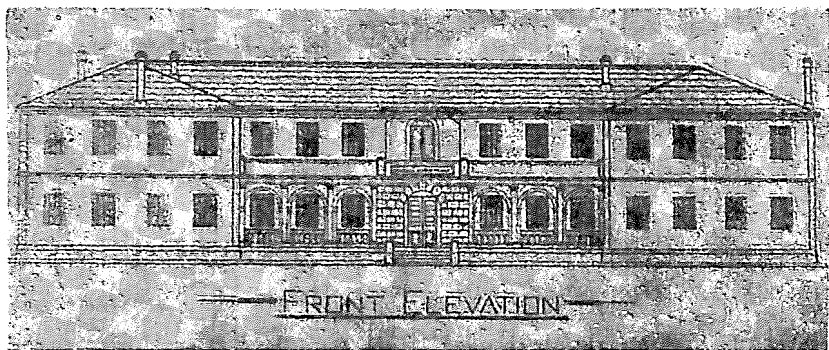
Front View of Proposed Plan